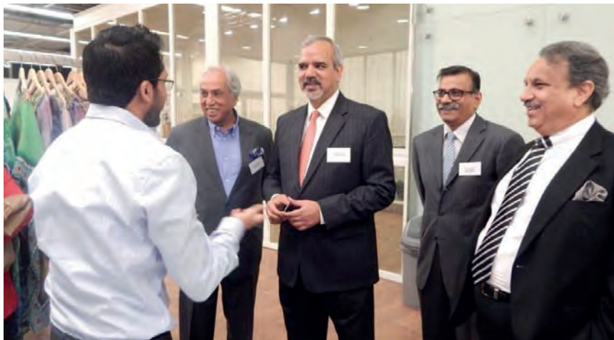
Ambassador of India interacting with the participants at the Apparel Buyer-Seller Meet

The Embassy of India, The Hague in association with the Apparel Export Promotion Council (AEPC) organized an Apparel Buyer Seller Meet at Amsterdam on 23-24 June 2014 at World Fashion Centre, Amsterdam. A group of 20 Indian producers/exporters of garments from India led by the Chairman AEPC participated in the meeting/exhibition which was attended by members of the Dutch trade and bilateral trade organizations.