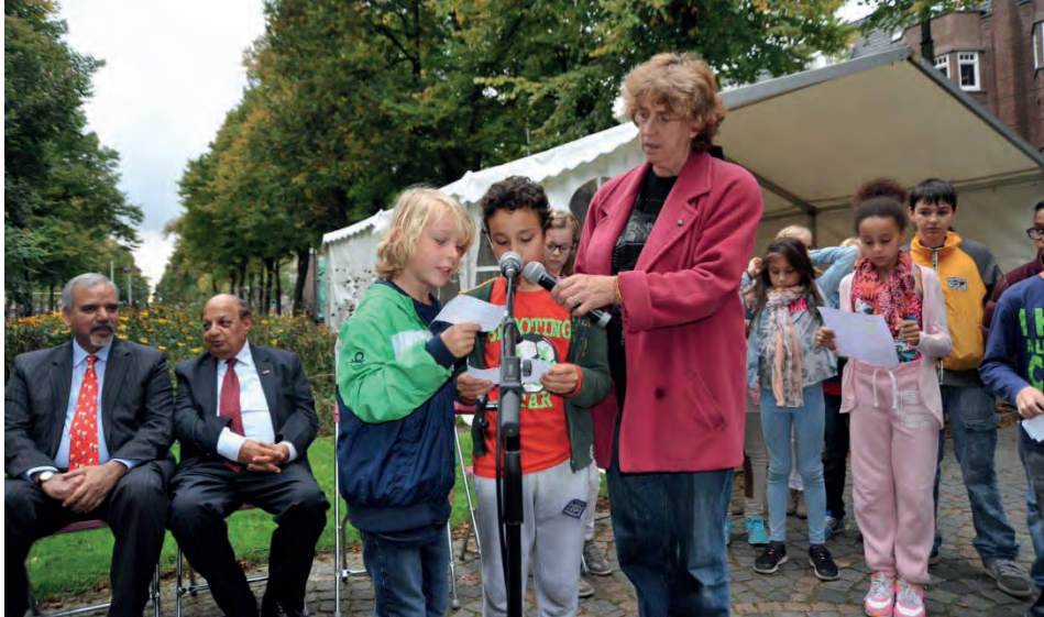
Schoolchildren presenting a cultural programme at the Gandhi Jayanti Celebrations in Amsterdam