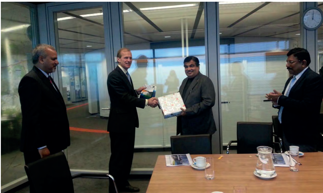
Hon'ble Minister of Road Transport, Highways and Shipping meeting with CEO of the Port of Rotterdam

Mr. Nitin Gadkari, Minister for Road Transport, Highways & Shipping, Government of India visited the Netherlands on November 19, 2014. During this visit, he met with the CEO of the Port of Rotterdam, Mr. Allard Castelein and discussed possibilities of cooperation between India and the Port of Rotterdam. The Hon'ble Minister also met representatives from leading Dutch companies in the field of inland waterways, ports, tunnels and infrastructure sectors.