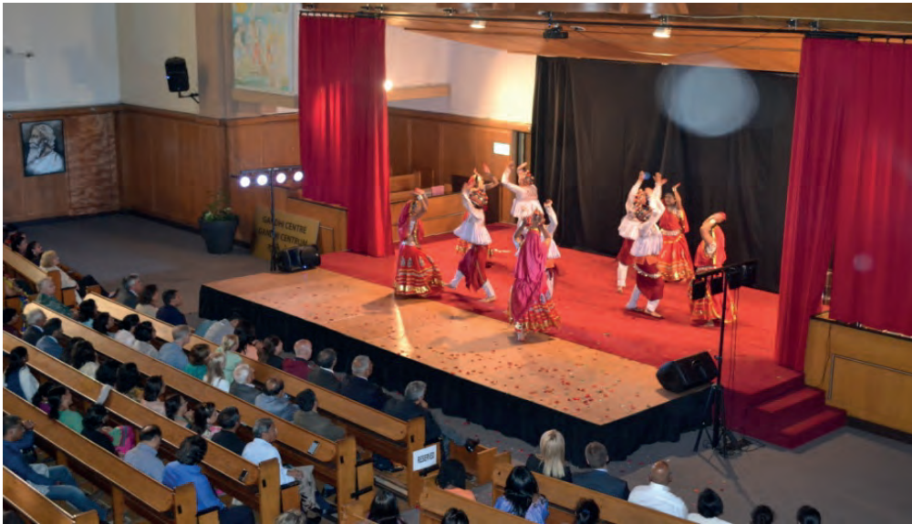
Performance by Saptak Group at Gandhi Centre

A colourful cultural programme of Gujarati Folk Dance 'Saptak' was organized on 5 July 2014 at Gandhi Centre. The event was attended by about 250 invitees, including members of Diplomatic Corps, officials from the Royal Palace as well as prominent members of the Indian and Surinami-Hindustani community. The cultural troupe was sponsored by the Indian Council of Cultural Relations (ICCR).