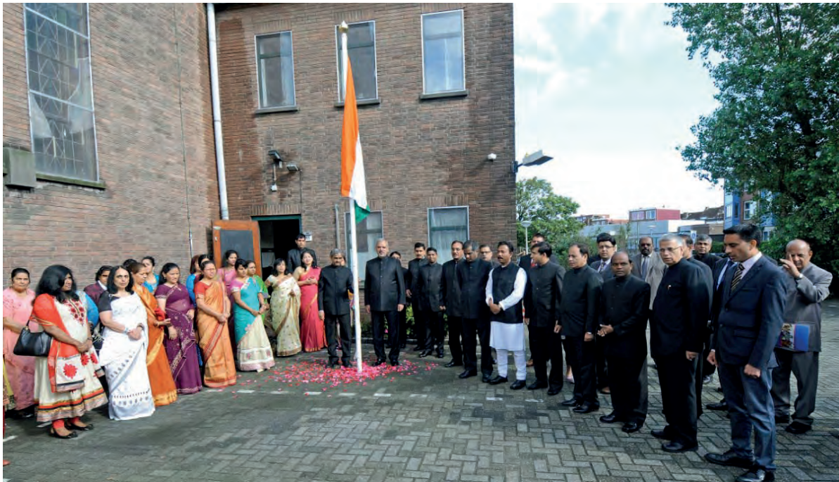
Independence Day Celebration at Gandhi Centre, The Hague

On the occasion of the 68th Independence Day of India, the Embassy of India in The Hague organized the Flag Hoisting ceremony at the Gandhi Centre (Cultural Centre). Over two hundred people from amongst the Indian diaspora, persons of Indian origin, Dutch and members of Surinami-Hindustani community attended the event.