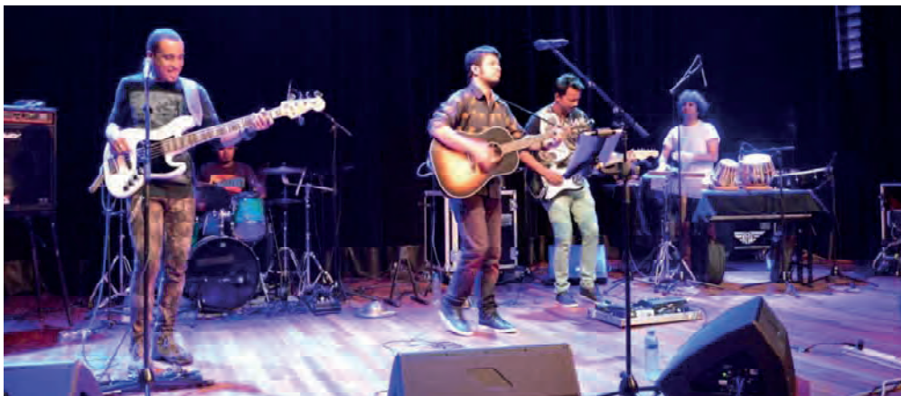
Papon and East India Company performing at Erasmus Pavilion Rotterdam

India's famous fusion band 'Papon and East India Company', participated in the Holland India Festival in the second half of October. On an ICCR-sponsored visit to the Netherlands, the band performed in Amsterdam, Rotterdam and The Hague. The performances attracted large audiences on all three occasions. Various dignitaries including Ambassadors, Judges and senior government officials were present especially at the event held at Dr. Anton Philipszaal/Lucent Theatre in The Hague.